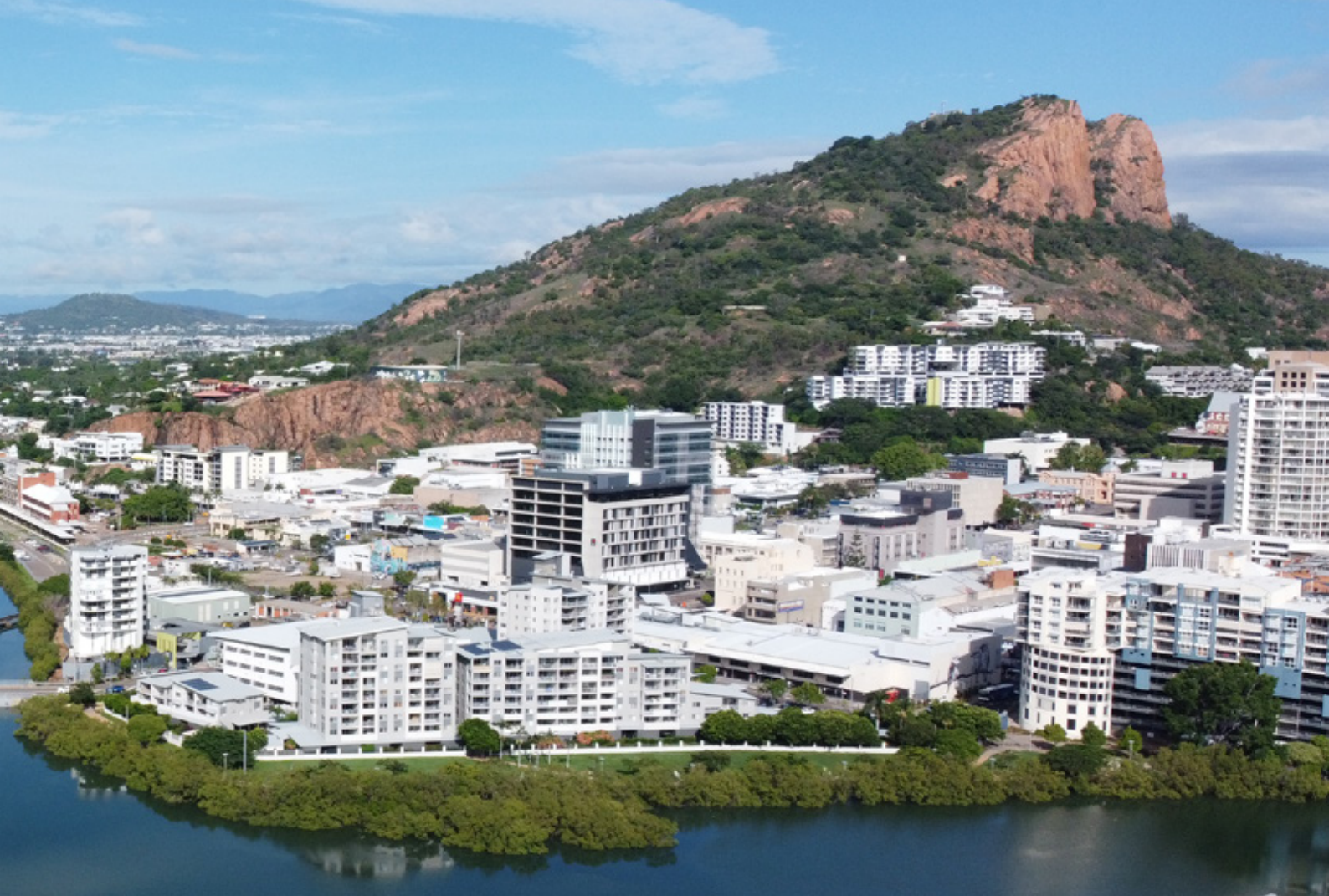
📍 QCB Stadium and Townsville CBD including Lowths Bridge connection