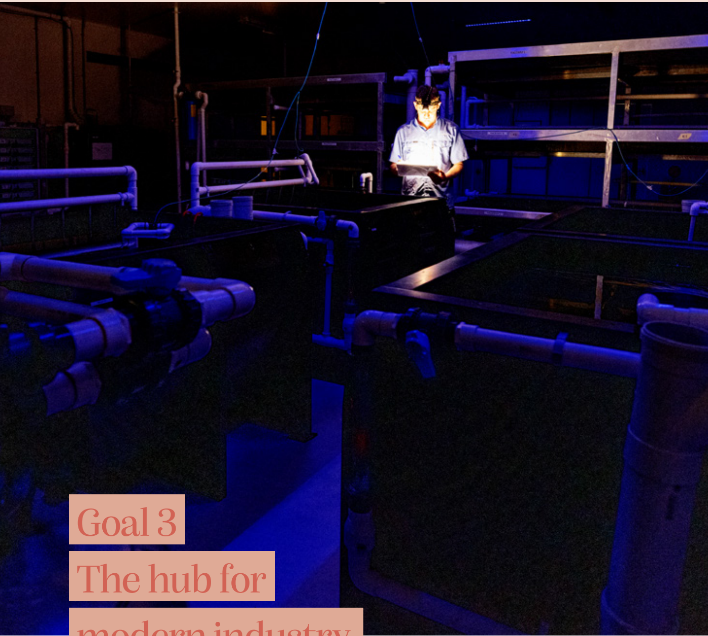
Ormatas Hatchery Toomulla Beach