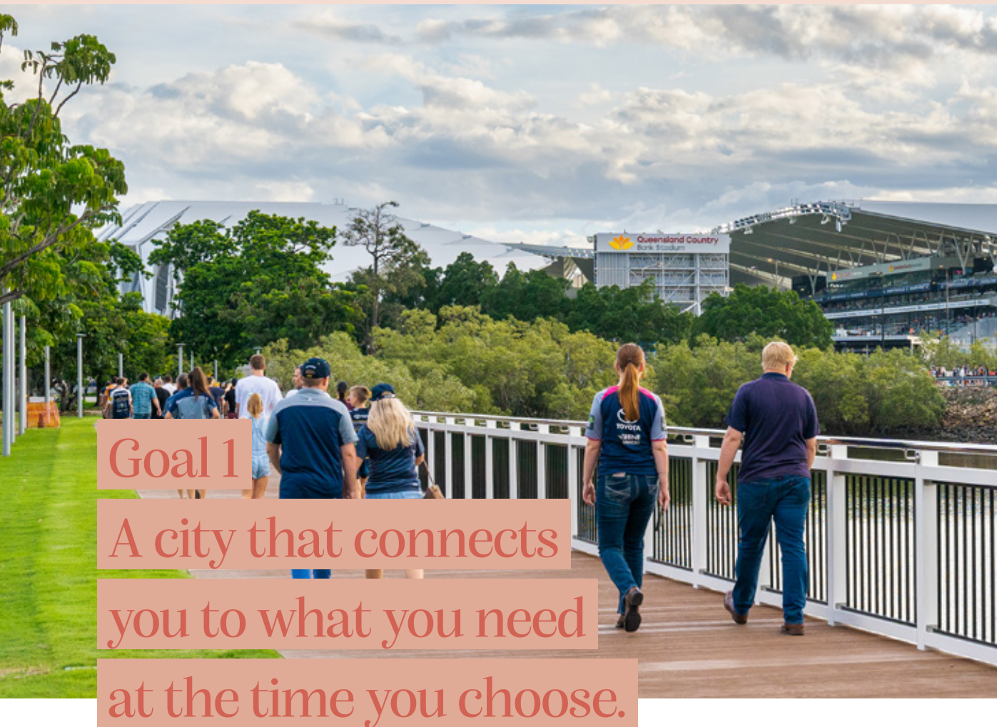
Central Park Boardwalk, Townsville CBD